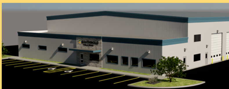
New Public Works Building